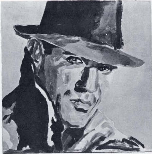
Walter Robinson untitled. 1980 Acrylic on board 12" x 12"

eral, what they remember of pictures in periodicals, books, television and movies. However, there is a significant difference between what they do and what the Pop Artists and photo-realists did. It has to do with the role of paint and painting in their art. This is the other issue that their work confronts.