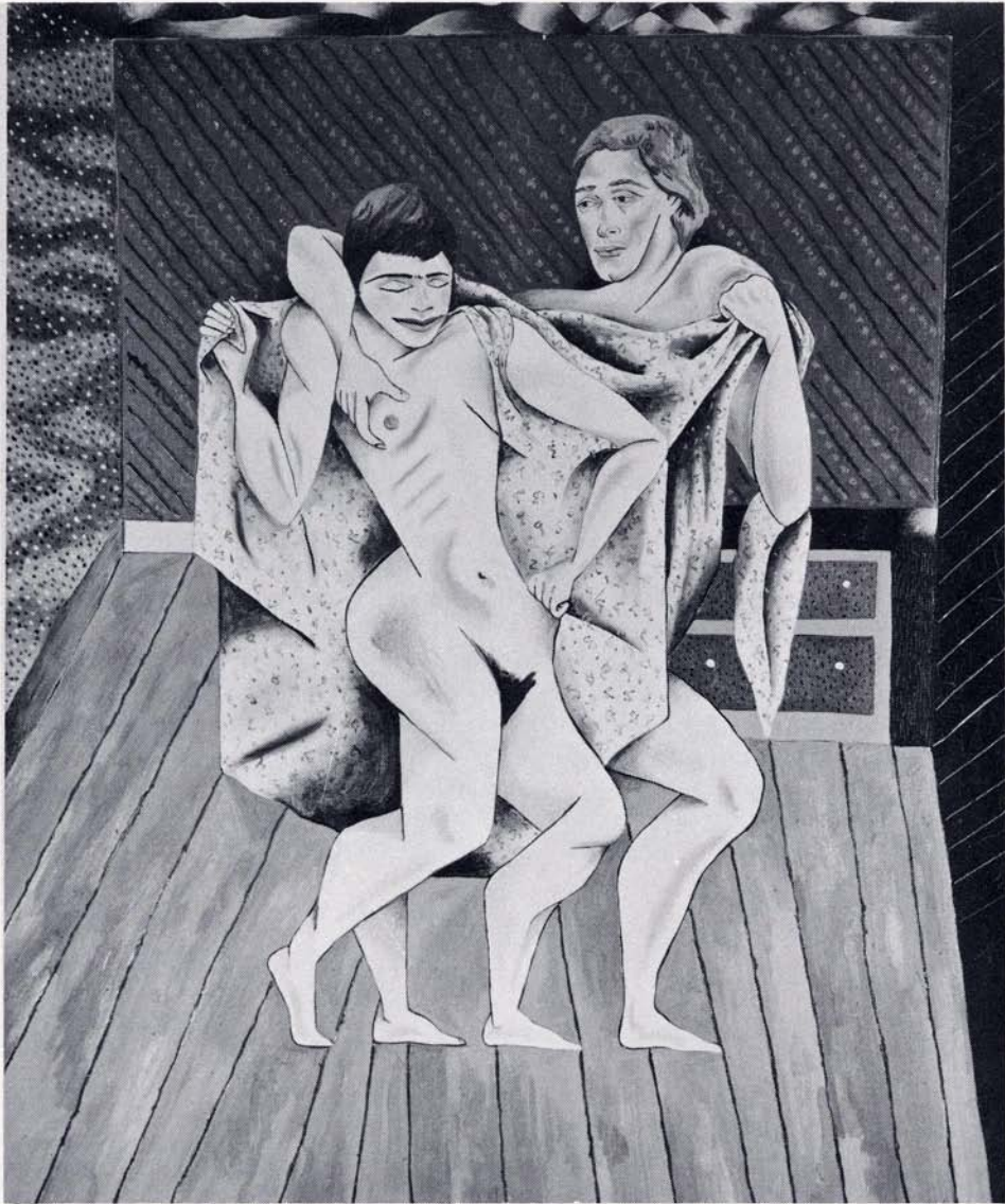
David Sharpe Two Figures , 7-21-80 Oil on canvas 42 x 30 inches