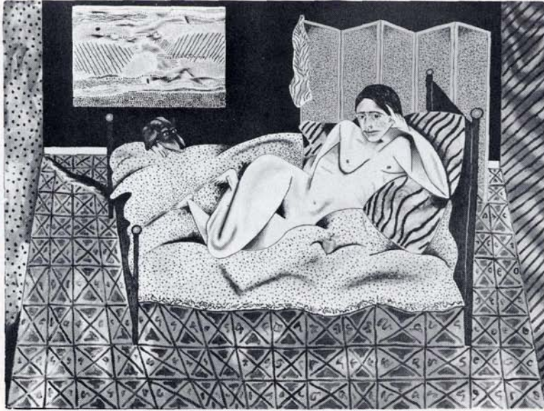
David Sharpe Nude with Painting and Dog , 6-22-80 Oil on canvas 50 x 66 inches