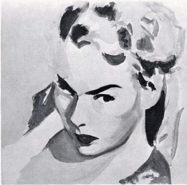
Walter Robinson untitled. 1980 Acrylic on board 12" x 12"

the handling of paint can show a new attitude towards subject matter – though that's what's happening here.