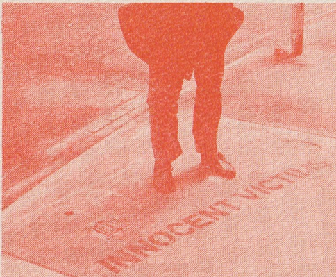
Death of a Mammal