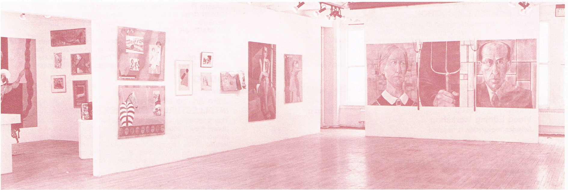
Hallwalls Members' Show, 1986. Installation view.