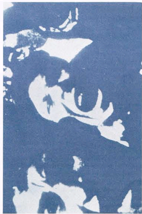
A still from The Hour of the Furnaces (1968), which will open the series Reviewing Histories: Selections From New Latin American Cinema on March 19-20.

HALLWALLS CONTEMPORARY ARTS CENTER 700 MAIN STREET, 4TH FLOOR BUFFALO, N.Y. 14202 716-854-5828