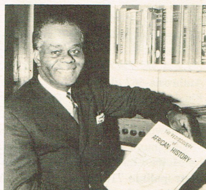
John Henrik Clarke