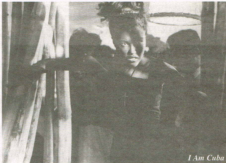
I Am Cuba

Citizen Action of New York , a not-for-profit grassroots organization, has launched a statewide campaign to advocate for affordable and universal health coverage and is inviting artists in all disciplines (visual arts, photography, writing, video documentary, etc.) to volunteer their time and talents to help tell the stories of the uninsured. Please call Citizen Action of New York's Buffalo office at 884-4033.