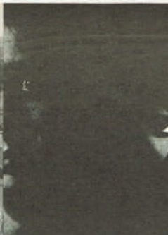
The Righteous Babes