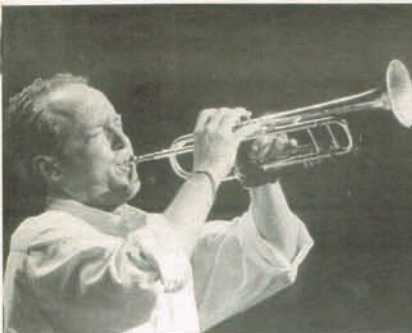
Tiny Bell Trio