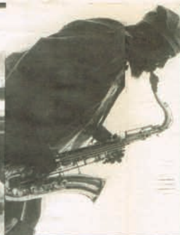
David S. Ware Quartet